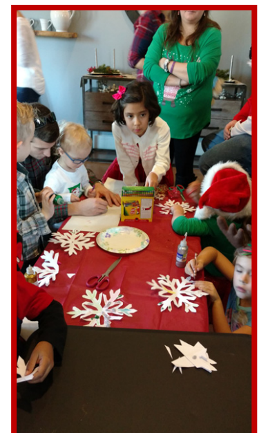
After decorating cookies, many of the kids cut out paper snowflakes and embellished them with color and glitter.