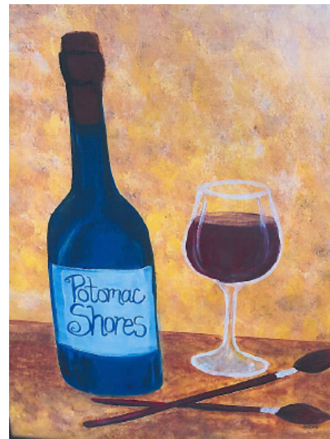
An example of the artistic works of Donna Merchant.

For information, such as the cost and how to make a reservation for PiYo and Barre Fit classes, art classes, or cooking classes, contact Kelly Whitzel at: 703 640-3967.