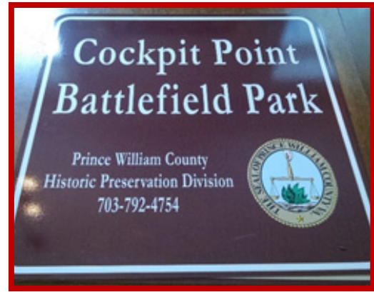
The new marker for Cockpit Point Battlefield Park located at 18245 Cockpit Point Road, Dumfries, VA 22026.

The batteries along the Potomac in Prince William County had an intimidating presence and immediate effect on the U.S. Navy as it commanded nearly 15 miles of Potomac River