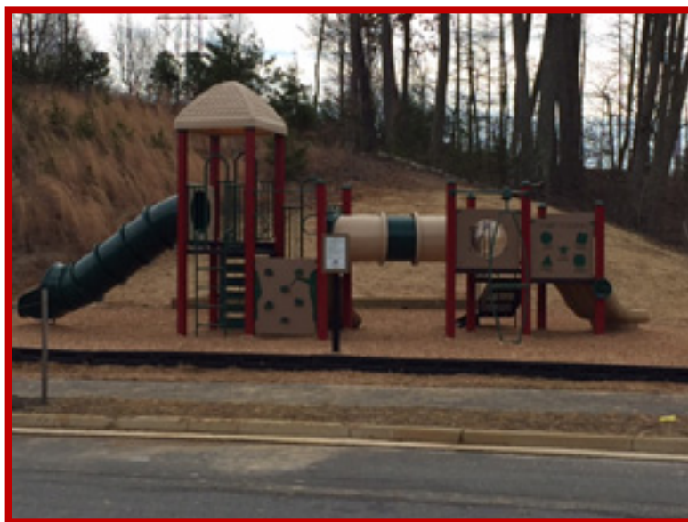
The tot lot along Potomac River Boulevard opened in late January. There is another similar tot lot on Spring Cress Drive near Sweet Pepperbrush Lane.

All residents are invited to attend a Construction Update Meeting on March 14 from 6 to 7 pm in the cafeteria of St. John Paul the Great High School. Residents will be able to ask questions following the presentation.