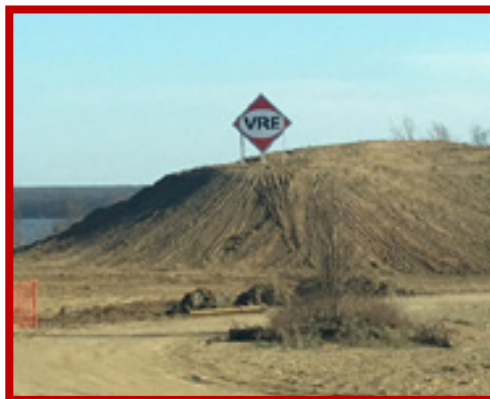
A VRE sign sits on the bluff above its future station in the yet to be developed town center.