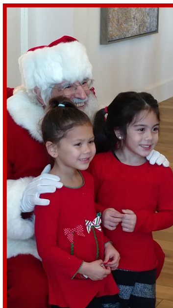
All of the kids at the "Icicles in Wonderland" event, patiently waited for the main event: a visit with Santa!